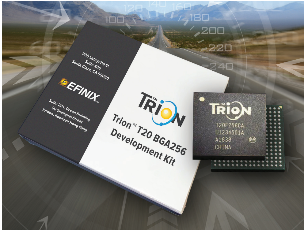
Figure 2 Trion T20 BGA256 Development Kit