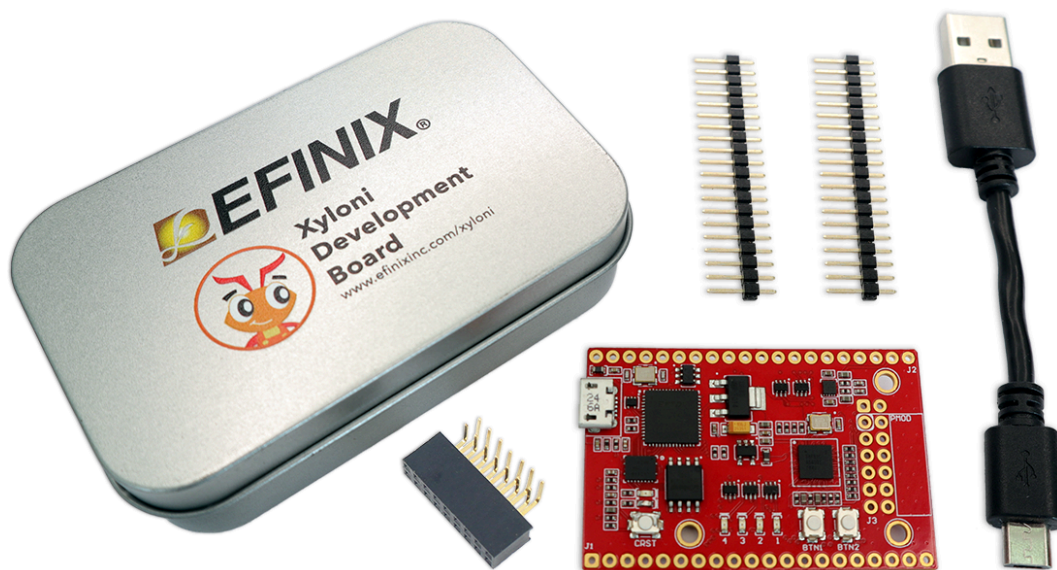
Figure 1: Xyloni Development Kit

Thank you for choosing the Xyloni Development Kit (part number: XYLONI), which allows you to explore the features of the T8 FPGA.